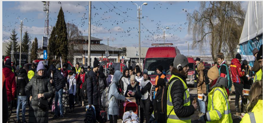
Ukraine - Romania border, March 2022.